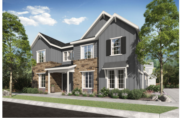
RANCH - 2942 SqFt