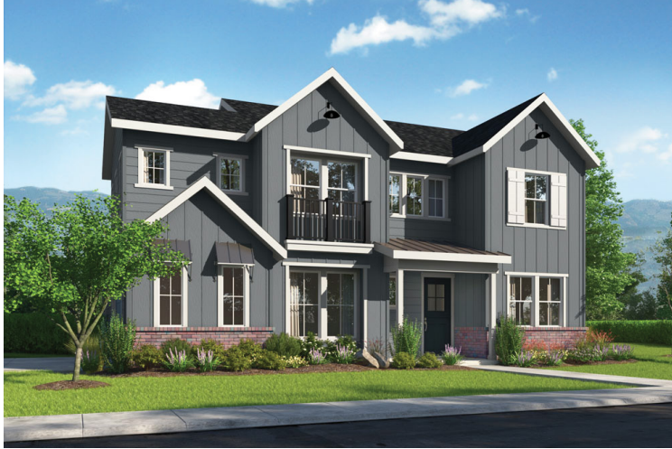
FARMHOUSE - 2873 SqFt