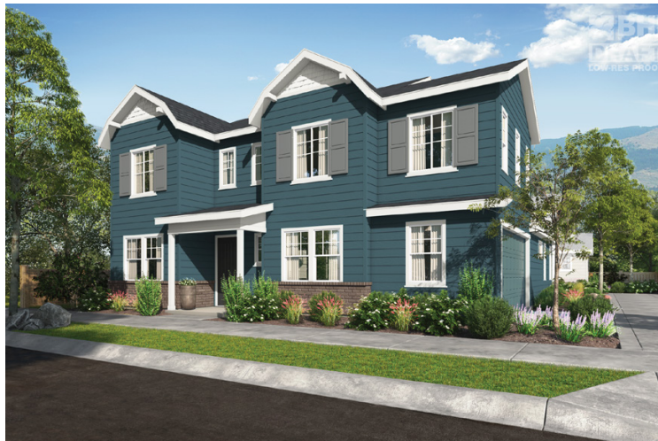
COLONIAL - 2869 SqFt