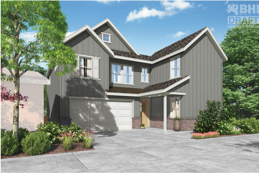
FARMHOUSE - 2778 SqFt