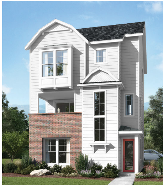
URBAN - 2241 SqFt