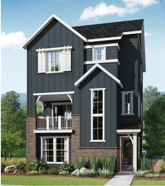
FARMHOUSE - 2226 SqFt