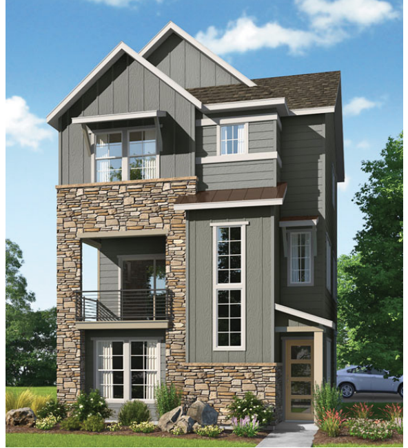
RANCH - 2226 SqFt