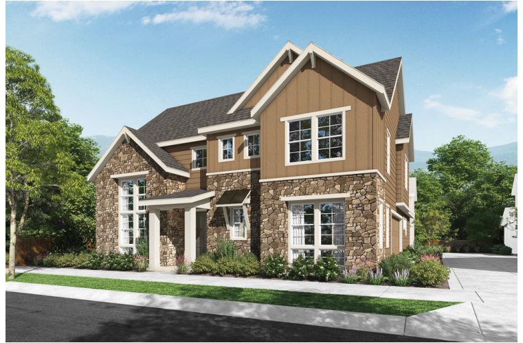
RANCH - 2670 SqFt