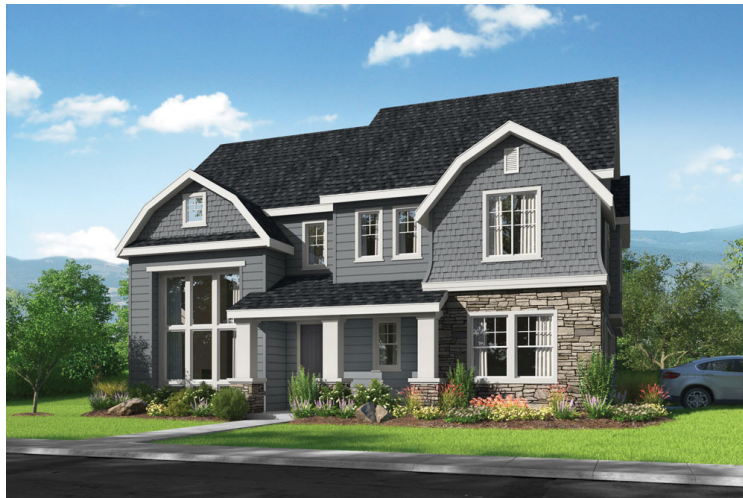
COLONIAL - 2670 SqFt