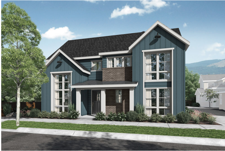
FARMHOUSE - 2670 SqFt